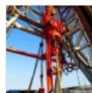
Top Drive Drilling